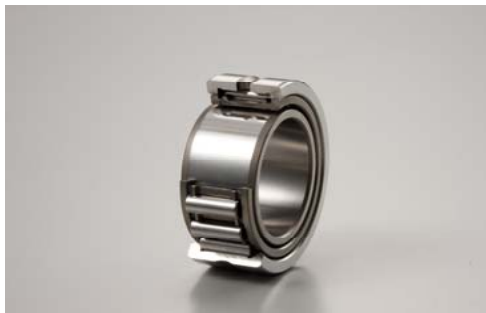
NA49..M, NKI..M TYPE